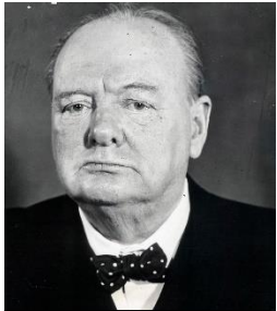
Winston Churchill: Prime Minister of Britain (1940 - 1945)