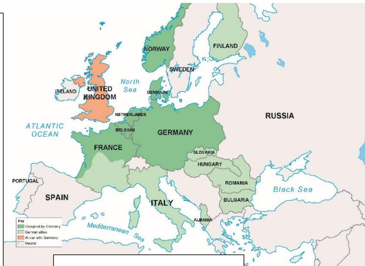
Europe - May 1940

By the end of May 1940, Nazi Germany had occupied almost all of Western Europe and driven the allied armies of Britain and France into the English Channel at Dunkirk.