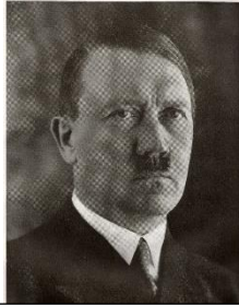
Adolf Hitler: Chancellor of Germany then self-anointed 'Führer' (supreme leader) (1933 - 1945)

Adolf Hitler's invasion of Poland in September 1939 drove Great Britain and France to declare war on Germany, marking the beginning of World War II. Over the next six years, the conflict would take more lives and destroy more land and property around the globe than any previous war.