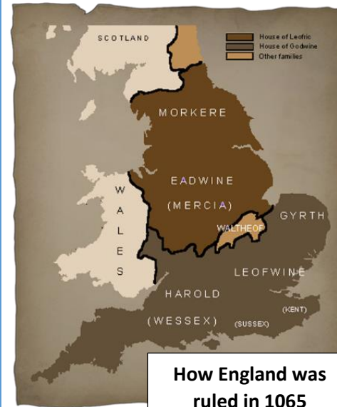
How England was ruled in 1065

In January 1066 Edward the Confessor , King of England, died childless. He had promised the throne to two different men, but several people wanted to be king.