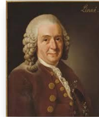
Carl Linnaeus (1707 – 1778) was a Swedish scientist who devised a system for classifying living things.

Living things are classified into groups according to their common characteristics; these include microorganisms, plants and animals.